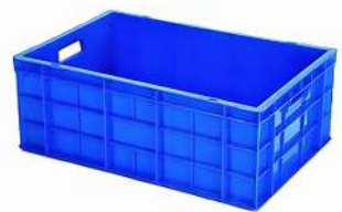
PLASTIC BIN : 600 X 400 SERIES

SP - Side Perforated TP - Total Perforated