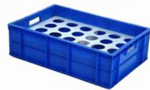
CIRCULAR CUT PARTITION