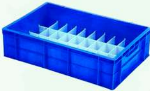
CROSS POCKET PARTITION