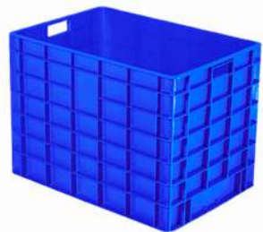
JUMBO CRATES : 650 X 450 SERIES

SP - Side Perforated TP - Total Perforated