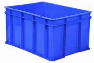
PLASTIC BIN : 400 X 300 SERIES