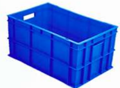
PLASTIC BIN : 500 X 325 SERIES

SP - Side Perforated TP - Total Perforated