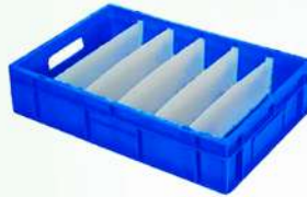
STRAIGHT POCKET PARTITION